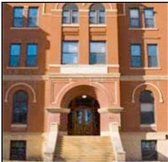
The front of the Katherine-Gibbs School.

The mission of the Katharine Gibbs School is to provide its students with the foundation for lifelong learning. Whether they choose to continue their education or enter the workforce, Gibbs graduates are trained to succeed. The school specializes in education in industries such as design, business administration, computer technology, criminal justice, and health care. The Gibbs School believed in creating a dynamic learning environment, both inside and outside of the classroom. Whether students needed help within individual courses or were simply looking to expand their horizons through a variety of social, cultural and educational activities, the Katherine-Gibbs School provided the resources to enable their students' success.